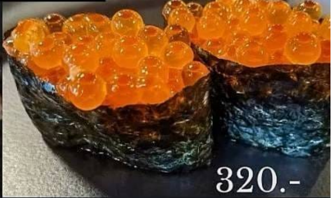
N 12 Ikura