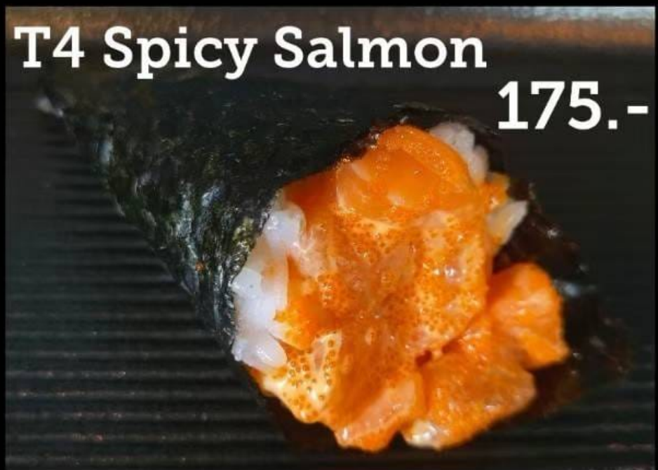
T4 Spicy Salmon 175.-