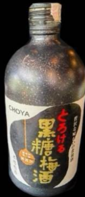
Choya 14% vol 720ml.