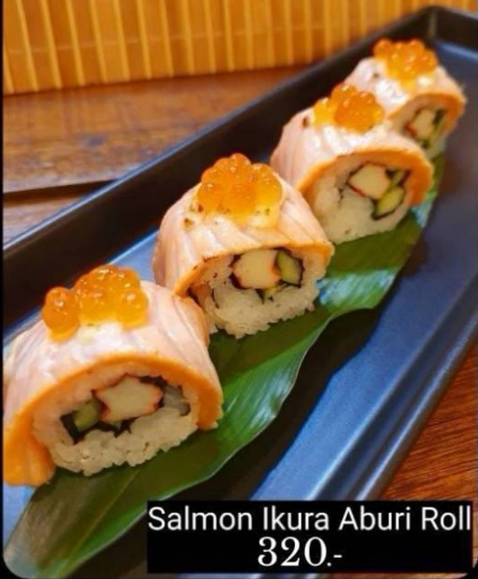
Salmon Ikura Aburi Roll 320.-