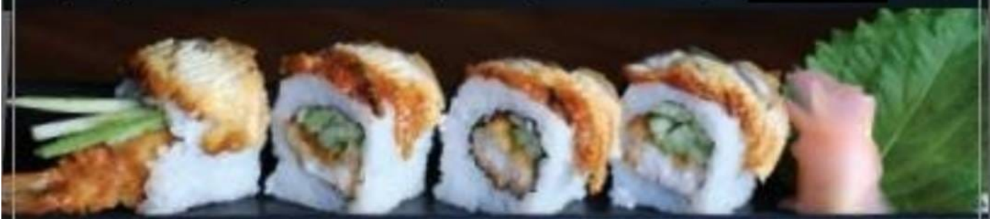
F8 Benzo Roll Fried Prawn, Cucumber, Japanese Eel on The Top 345.-