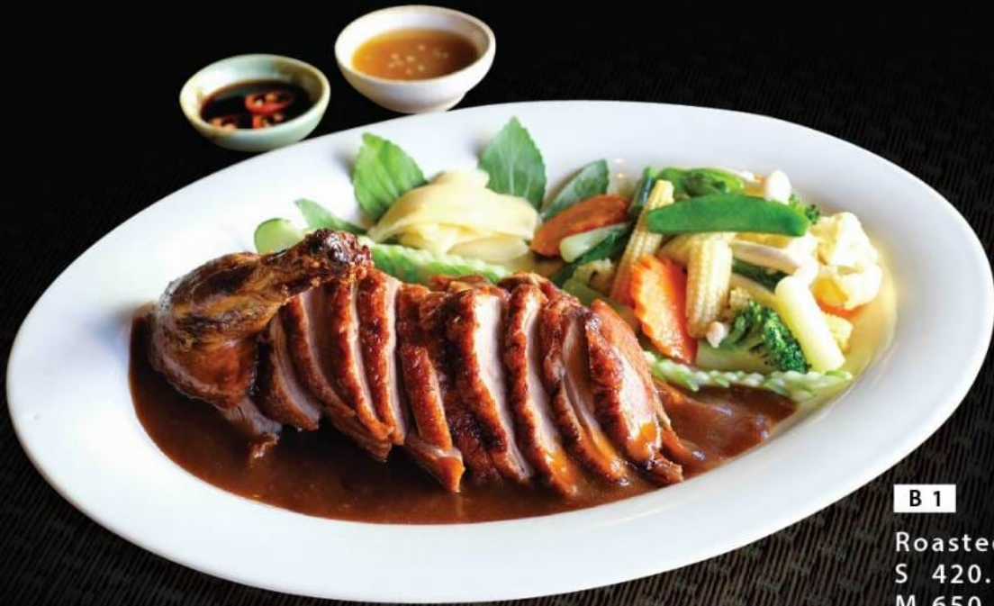
B 1 Roasted Duck S 420.- M 650.- L 890.-