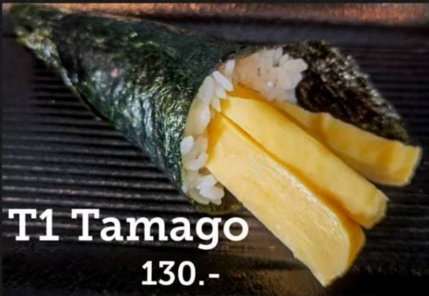
T1 Tamago 130.-