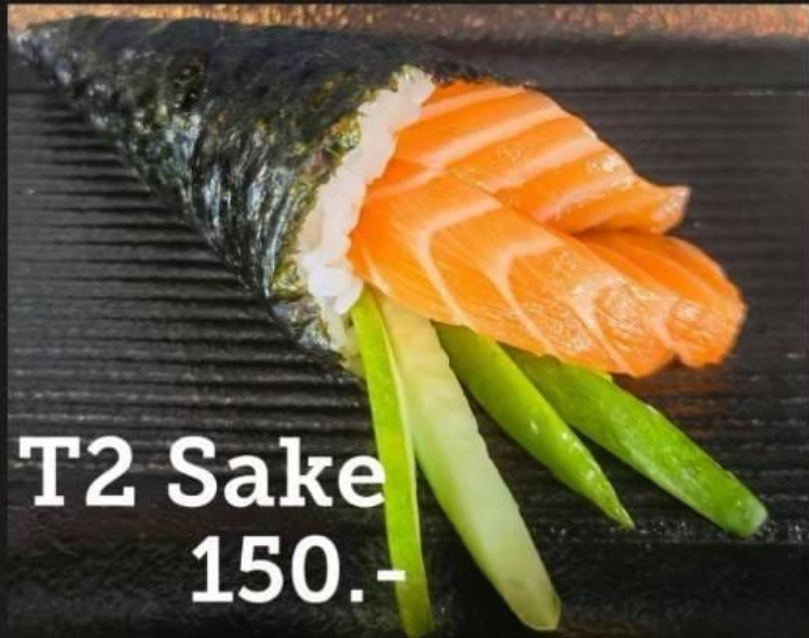
T2 Sake 150.-