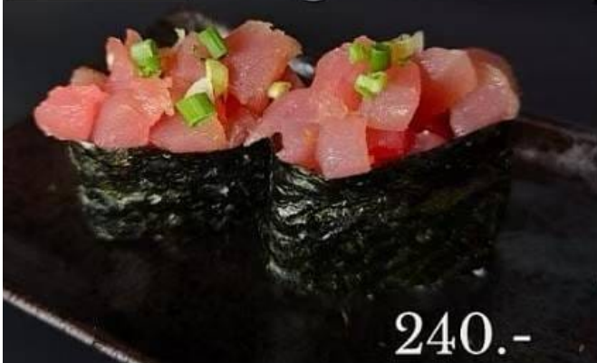
N 13 Nigitoro