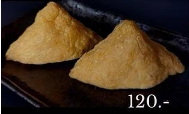
N 9 Inari