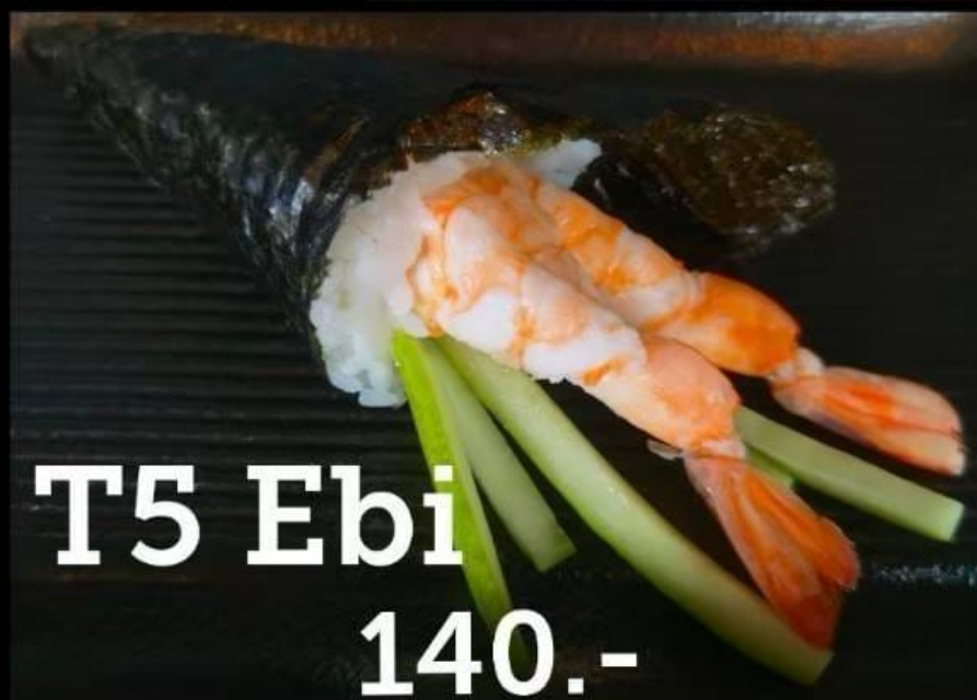
T5 Ebi 140.-