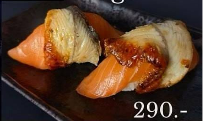
N 10 Sagi