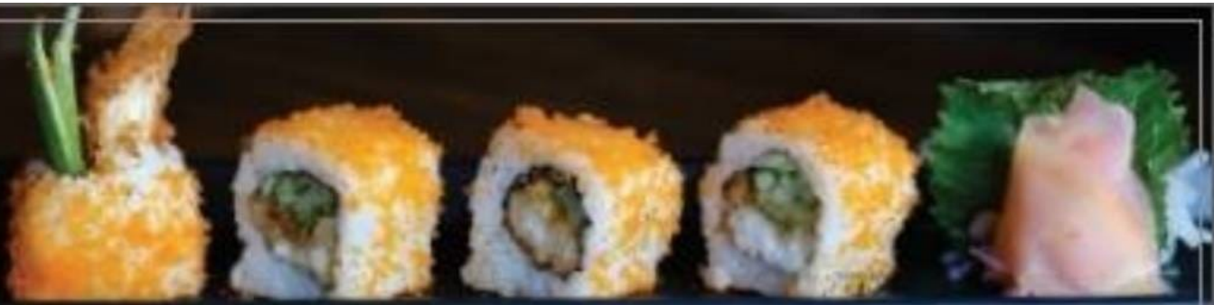
F7 Ebi Tempura Roll Fried Prawn, Cucumber, Tobiko on The Top 275.-