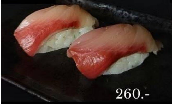
N 15 Hamachi