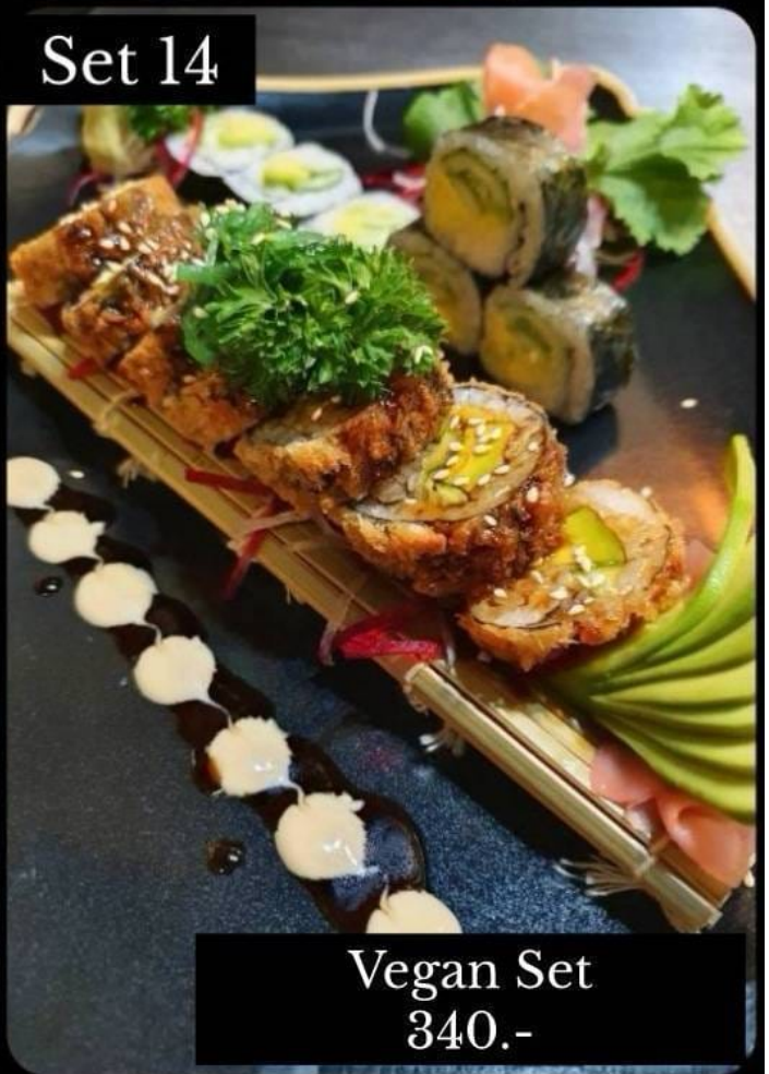
Vegan Set 340.-