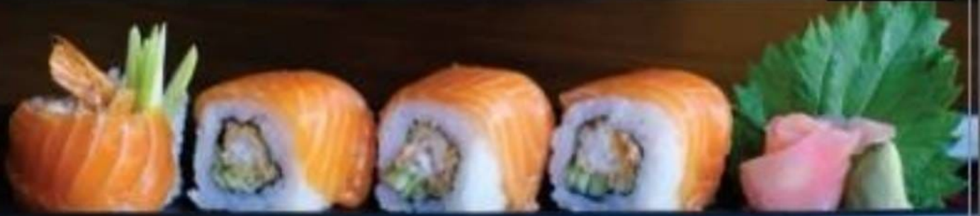
F10 Ebi Salmon Roll Fried Prawn, Cucumber, Salmon on The Top 295.-