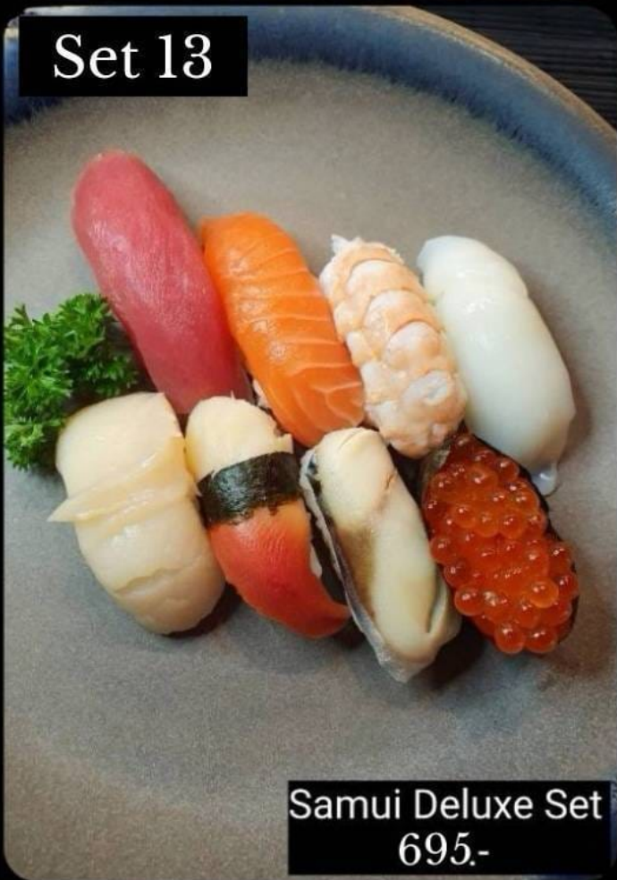
Samui Deluxe Set 695.-