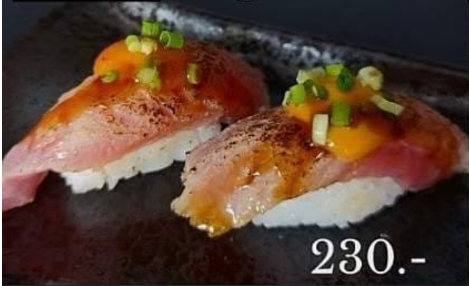
N 11 Maguro Aburi