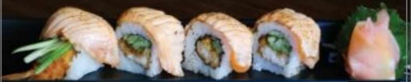
F9 Ebi Salmon Aburi Roll Fried Prawn, Cucumber, Flamed Salmon on The Top 295.-