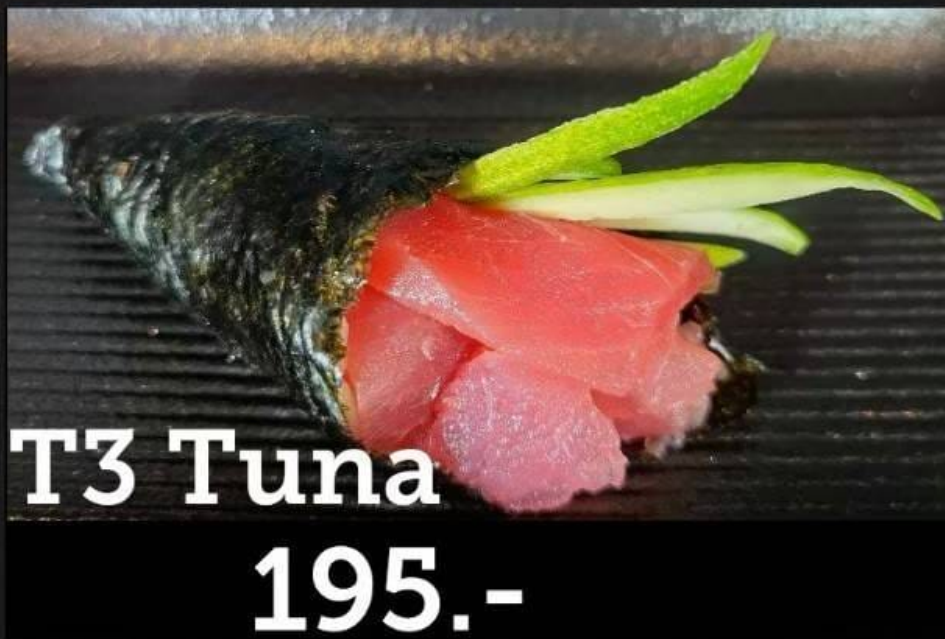
T3 Tuna 195.-