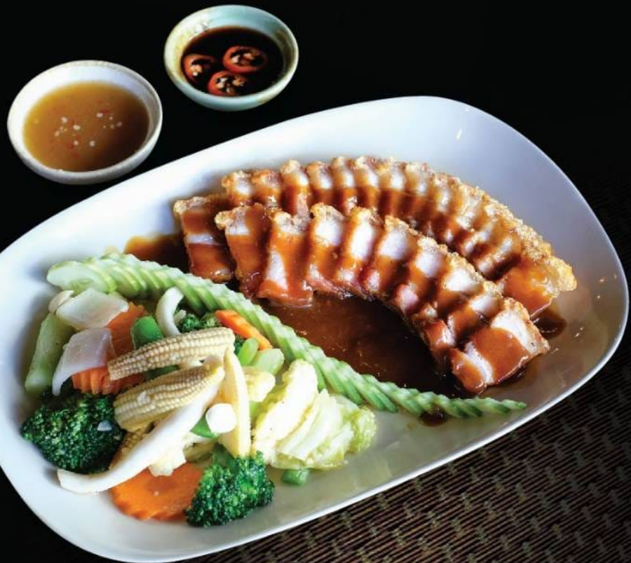
B 2 Crispy Pork S 420.- M 650.- L 890.-