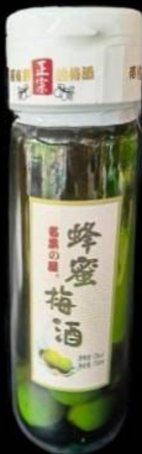
Mingguozhiwu Plum Wine