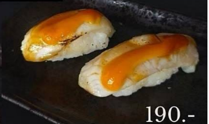
N 14 Izumi Aburi