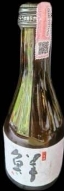
Hokkan Sen 13.5% vol 300ml.