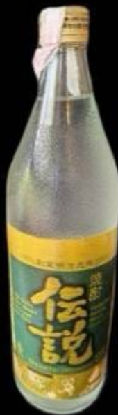
Shouchu densetsu 25°