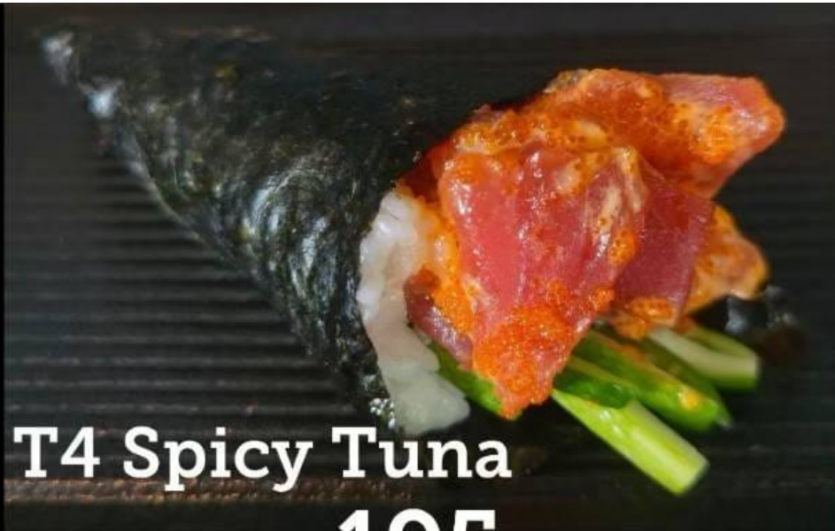
T4 Spicy Tuna 195.-