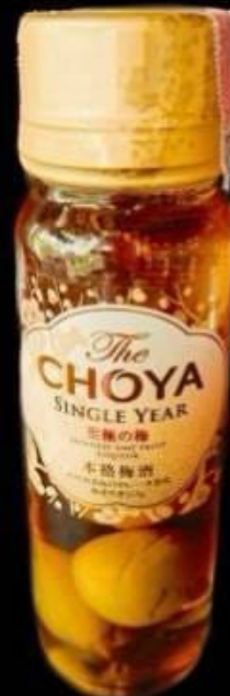
Choya single year golden Ume fruit