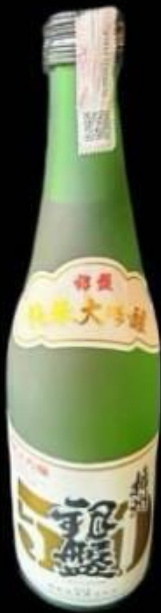
Ginban Sake premium 50% vol 720ml.