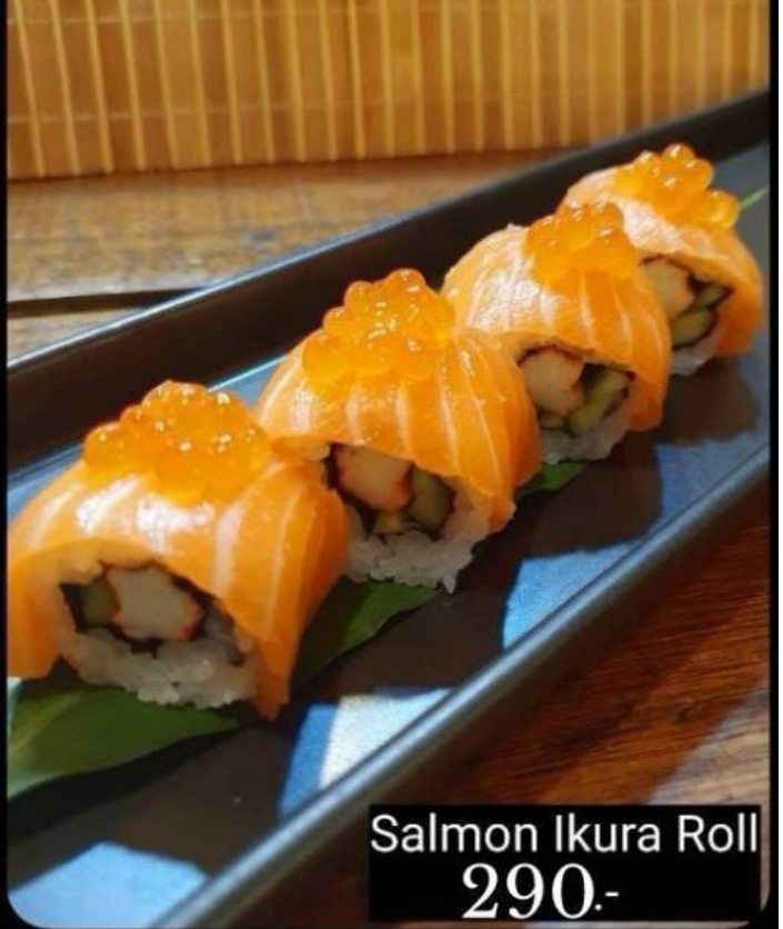
Salmon Ikura Roll 290.-