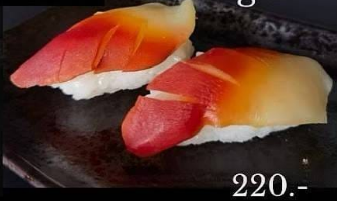
N 16 Hokkigai