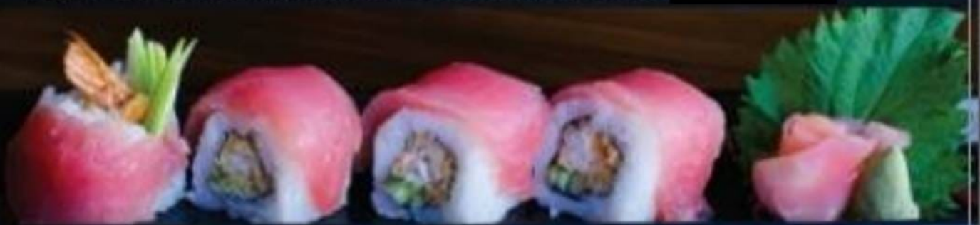
F11 Ebi Tuna Roll Fried Prawn, Cucumber, Tuna on The Top 345.-